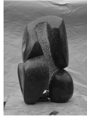
Figure- 4: Growth 19, 12"X10"X8", Black Marble, 2020

sculpture depicts the continuous journey of life, the visual representation of human existence and Nature. The sculpture is a symbol of humanity's interconnectedness and the continuous cycle of life, human struggle and ability to overcome obstacles, constantly reaching new heights and striving for growth. The idol of growth is made of black marble. This sculpture not only represents the concept of growth, but also can inspire. Growth is a natural and necessary part of life; change and progress are always possible. This sculpture gives the viewer a sense of introspection and contemplation. It also serves as a reminder that growth is not always linear or predictable, but rather a continuous process that requires patience, resilience and an open mind. (Figure- 4)