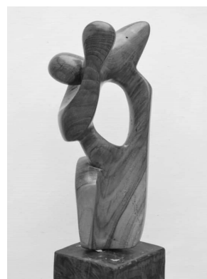
Figure- 3: 'Togetherness', 20"X4"X4", Wood, 2019

Growth 19: Another creation by Goldie depicts the concept of development. It depicts natural elements such as plants, trees, or even abstract shapes that symbolize growth. This