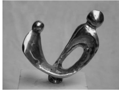
Figure-2: 'Mother and Child', 12"X12"X4", Bronze, 2018

surroundings and devoted only to your child is showing the mother's affection. This sculpture has been made in an abstract style but the sentiment of love shown in it is giving shape to the abstract, which gives more peace to the soul of the viewer. The main motive of this masterpiece is to express the feelings of love of a mother and a child towards each other. (Figure-2)